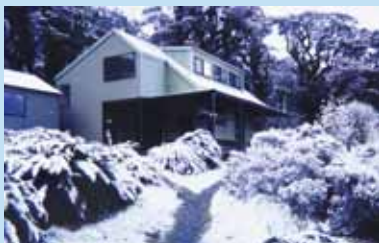
Mackenzie Hut after a snow fall.

During winter for your own safety intention forms should be completed at the Fiordland National Park Visitor Centre in Te Anau. Please don't forget to sign out. Intentions forms can also be left in the box outside the Department of Conservation office in Glenorchy.