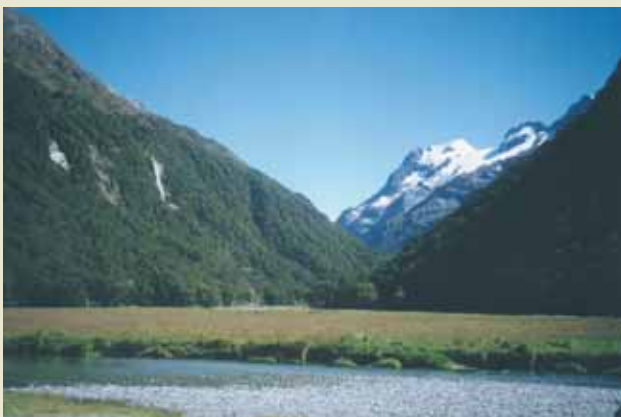
North branch of the Route Burn.