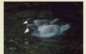
Blue Ducks.