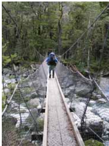
Swing bridge over the Route Burn.

From the Routeburn Flats Hut cross the unbridged Route Burn and follow the North Branch through beech forest and tussock clearings. Good views of Mt. Somnus, North Col and Mt. Nereus can be found at the head of the valley.