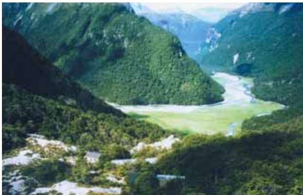
Routeburn Valley.

Hunting is not permitted on the Routeburn Track. Hunters can use the track for access to the side valleys, where limited hunting opportunities are available. Rifles must be carried with the bolt removed when on the track. A hunting permit is required, available from the Fiordland National Park Visitor Centre in Te Anau and the Department of Conservation offices in Glenorchy and Queenstown.