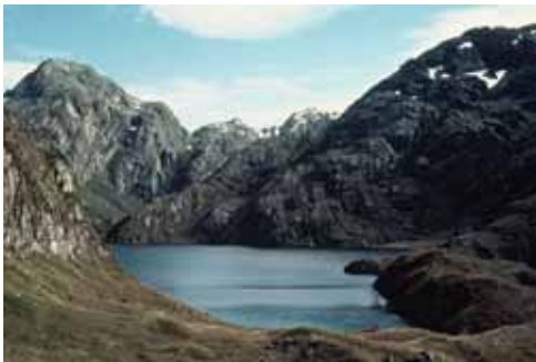
Lake Harris.

The track follows close to a major fault zone which has thrown together both metamorphic and sedimentary rocks. During the Ice Ages, the last of which ended some 10,000 years ago, huge glaciers carved out the rock. The Hollyford glacier was so large it curved around the southern end of