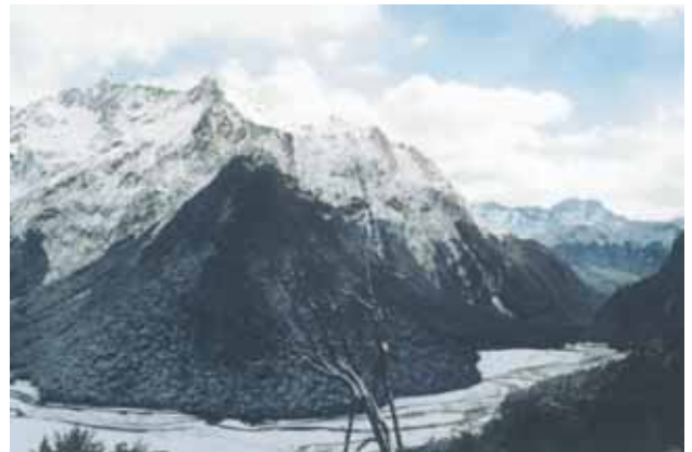
Routeburn Valley in snow.