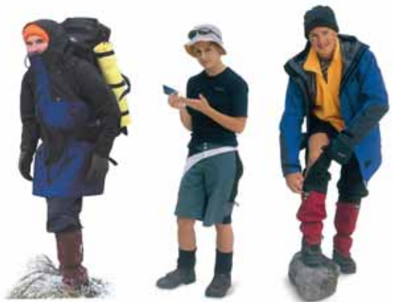
Appropriate clothing for walking the Routeburn Track.

Woollen hat/balaclava, sunhat and sunglasses. Extra socks, underwear, shirt or lightweight jersey.