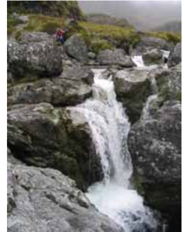
Routeburn Falls.

This is a steady climb through beech forest crossing two swing bridges. Excellent views of the valley below can be seen from a slip that was created during heavy rain in 1994 which washed away the original track. Care should be taken crossing this slip, especially after heavy rain. The Emily Creek bridge is considered to be the halfway mark.