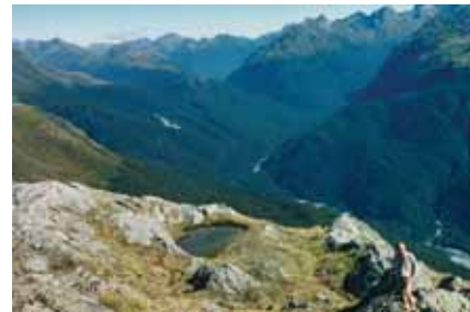
Summit of Conical Hill, looking to the head of the Hollyford Valley.

This sub-alpine section of track is very exposed and can be extremely hazardous in adverse weather conditions. Ensure that you listen to the advice of Department of Conservation staff in such conditions. The track climbs steadily, following the Route Burn to its outlet from Lake Harris. A steep side through moraine and the bluffs above Lake Harris leads to the Harris Saddle/Tarahaka Whakatipu (1255m) and the shelter, which is available for day use only. Allow 1½ - 2½ hours for the climb. Sub-alpine herbs and cushion plants are a feature of the vegetation. These areas are very fragile so please keep to the track. A short, steep, rocky climb