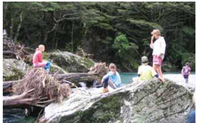
Day walkers at the Route Burn.

There are a number of guided day-walk opportunities available starting from either end of the track.