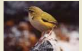
Rock Wren.