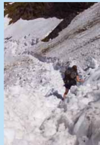
Crossing avalanche debris.

Always check current weather and avalanche conditions before departing on your trip.