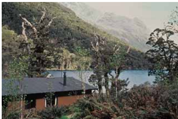
Howden Hut and Lake Howden.

Please use toilets at the huts and shelters. If this is not possible, bury toilet waste well away from watercourses. Remember, drinking water at the huts and shelters comes from rivers and lakes.