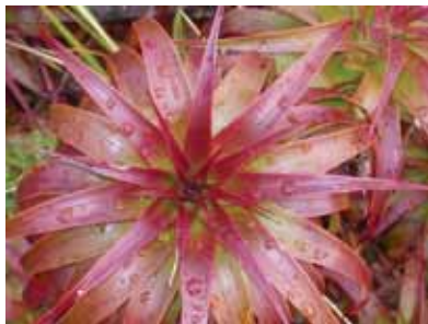
Pineapple shrub ( Dracophyllum menziesii ).

Beech is the dominant forest tree, with red beech around the start of the Routeburn Valley on sunny, frost-free sites. Mountain beech occurs at higher altitudes within the Routeburn Valley. Silver beech competes best on the wetter Hollyford faces along with broadleaf and fuchsia. A feature of the beech forest is the abundance of ferns, mosses, lichens and perching plants.