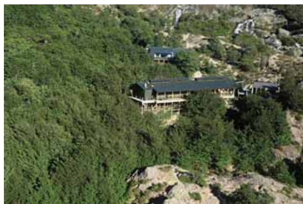
Routeburn Falls Hut.

Camping outside the designated campsites and staying overnight in the shelters is not permitted on the Routeburn Track. Facilities for guided walkers are not available to independent walkers.