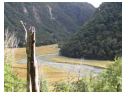
View of the Routeburn Flats.

The Routeburn Track traverses thirty-two kilometres of Mount Aspiring and Fiordland National Parks, part of Te Wāhipounamu - South West New Zealand World Heritage Area and is administered by the Department of Conservation on behalf of the New Zealand public.