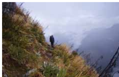
View of Hollyford Valley from the Hollyford Bluffs.

Please check for current conditions or weather warnings before departing on your trip.