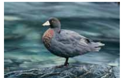
Whio (Torrent/Blue Duck).

The whio (torrent/blue duck) is a unique and endangered species. It is endemic to New Zealand and has no close relative anywhere in the world.