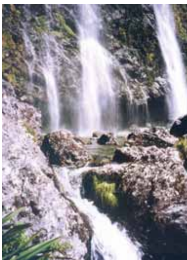
Earland Falls.

The track crosses a small flat before climbing steeply to the bushline. It then gradually descends past the 'Orchard', an open grassy area dotted with ribbonwood trees, to the Earland Falls (174m). An emergency bridge is situated down stream should the falls be in flood. The track continues its gradual descent to Howden Hut, situated at the junction of the Routeburn and Greenstone/Caples Tracks. A campsite is situated at the Greenstone Saddle 20 minutes down the Greenstone Track. Lake Howden Hut has 28 bunks.