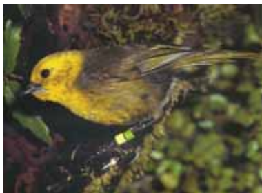
Mohua (yellowhead).

It is a tall-forest specialist, with strong legs and bill adapted to foraging for insects from the crevices of bark of mature trees. Mohua's use of small tree holes for nesting